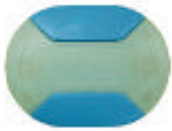
VV-GPNT2-J2 No Touch Guard Patrol Noctilucent Tags