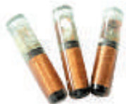
VV-GPFT3-J2 No Touch Guard Patrol Flush Tag